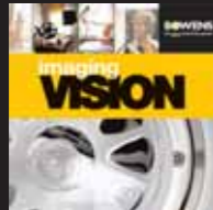
Imaging Vision Continuous lights & Accessories BC-240