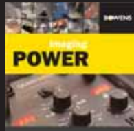
Imaging Power Generators & Accessories BC-112