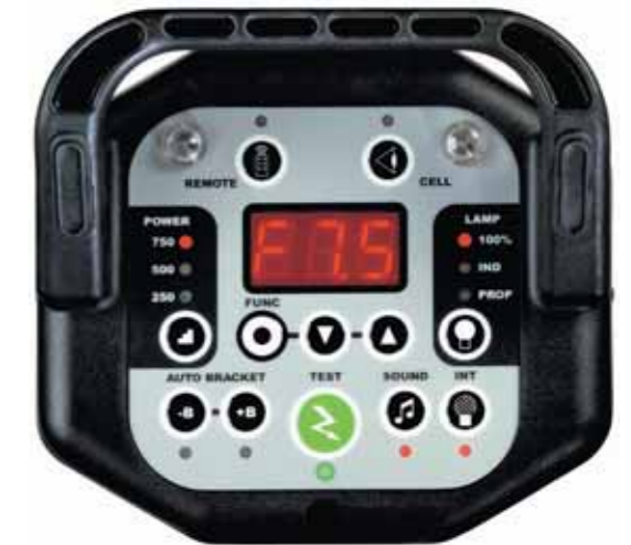
Precision digital power control