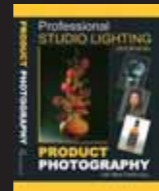
Professional STUDIO LIGHTING PRODUCT PHOTOGRAPHY Complete "How to" Guide BC-080