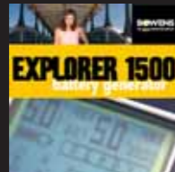
Explorer 1500 Battery Generator Guide BC-230