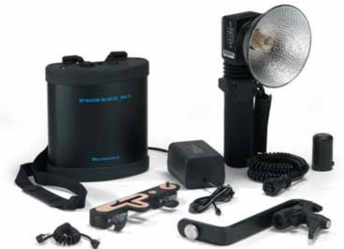
Pioneer SII Kit