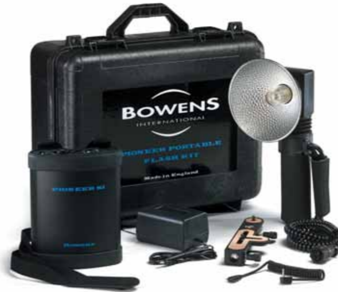
Pioneer SI Kit

“location-friendly convenience with studio-control savvy”