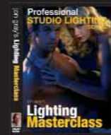
Professional STUDIO LIGHTING Lighting Masterclass BC-085