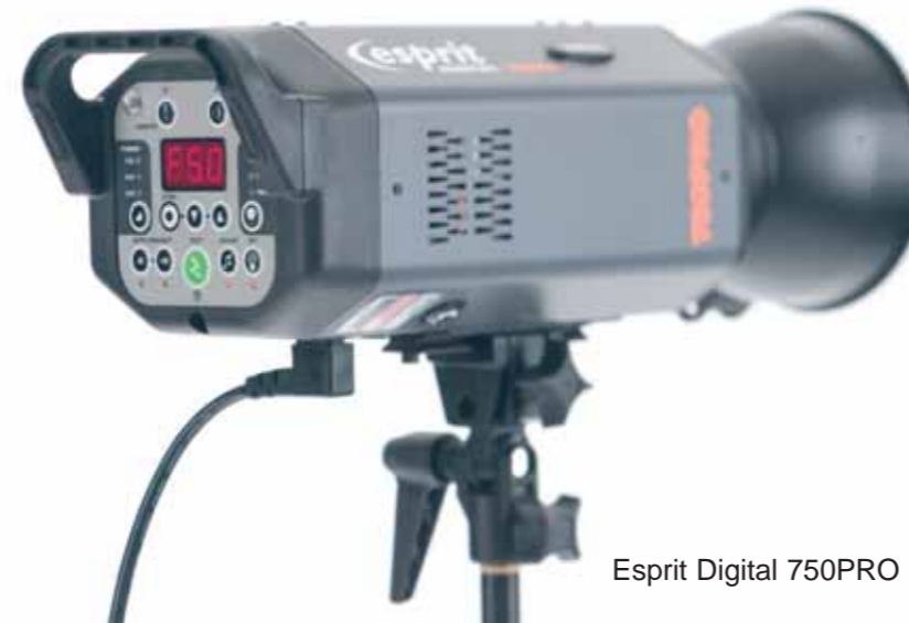
Esprit Digital 750PRO

“a superior level of lighting for today’s digital world”